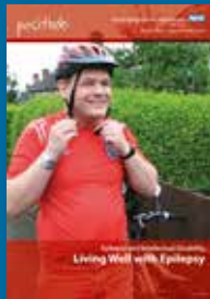
Living Well with Epilepsy