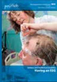
Having an EEG