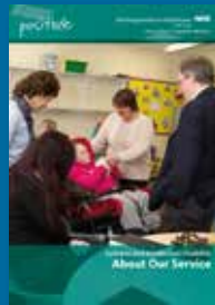
About Our Service