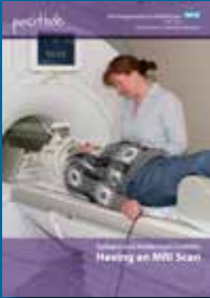
Having an MRI Scan