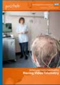
Having Video Telemetry