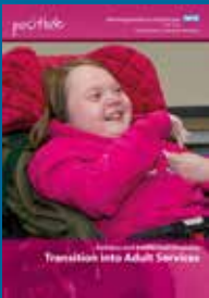
Transition into Adult Services